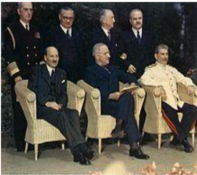
Photo # USA C-1860 "Big Three" & Foreign Ministers at Potsdam, ca. July 1945

Stalin insisted on a 'friendly government' in Poland. The West demanded free elections in Poland.